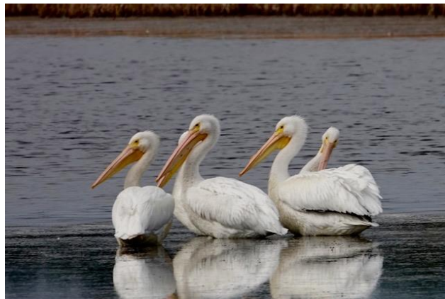
American White Pelicans