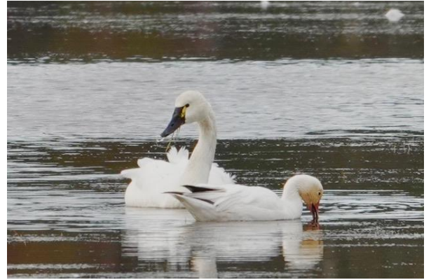
Tundra Swan and Snow Goose

This WMA area has many Owl boxes mounted, but all appeared empty at this time. Hopefully, next trip to Bear Island we will see some Owls.