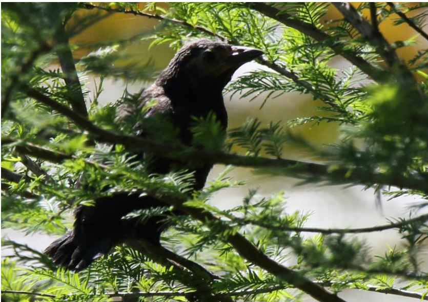
Recently fledged Common Grackle – Matt Tozar