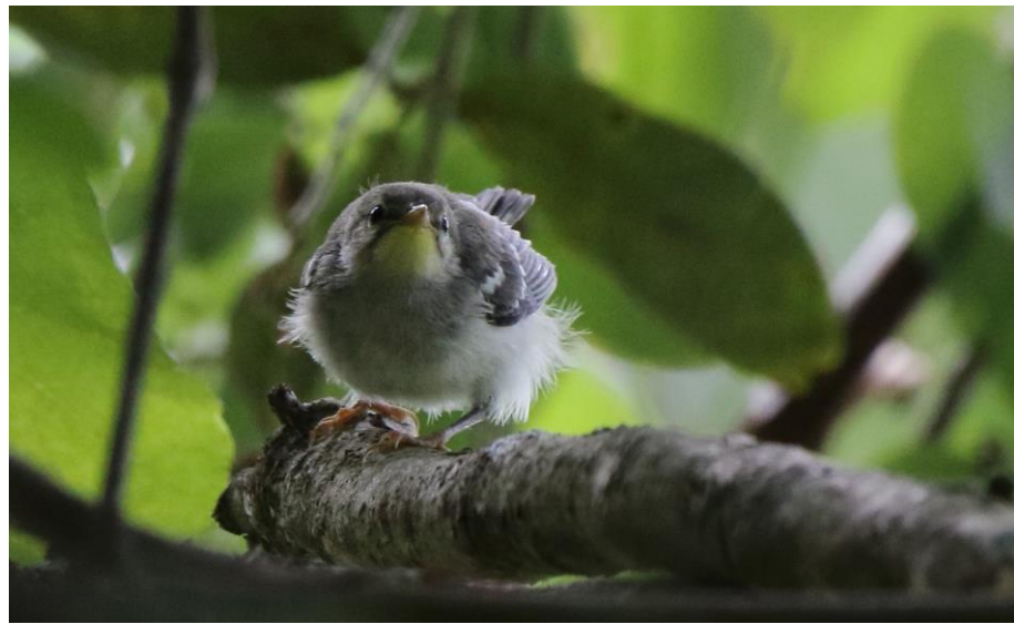
Recently fledged Northern Parula – Matt Tozar