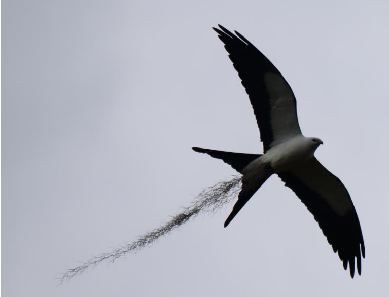
Swallow-tailed Kite with nesting material – Matt Tozar