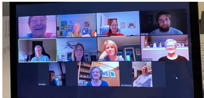
Ogeechee Audubon Board meets via Zoom for our May Meeting!

We hope you are staying safe and perhaps doing a little birding in your backyard or at a safe place where you can social distance (but not from the birds). Ogeechee Audubon Board has decided to continue in Flockdown. We will not have our public meeting in June and at this time, we will still hold off on conducting field trips. The logistics of having these events in light of the CDC guidelines is difficult. In addition, one of our primary concerns is the health and safety of our members. The Board will meet again in July to discuss if, when and how we can safely “reopen”. Please be patient knowing our caution is for your wellbeing. We will bird together again.