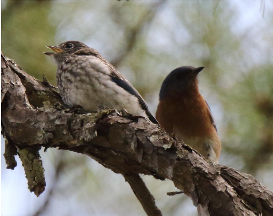
Adult and recently fledged Eastern Bluebirds – Matt Tozar