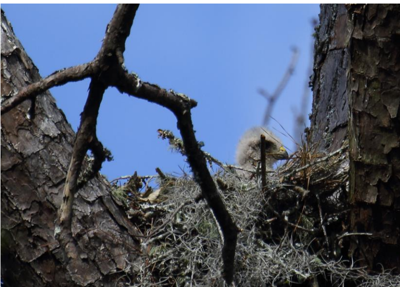
Red-shouldered Hawk nestling – Matt Tozar