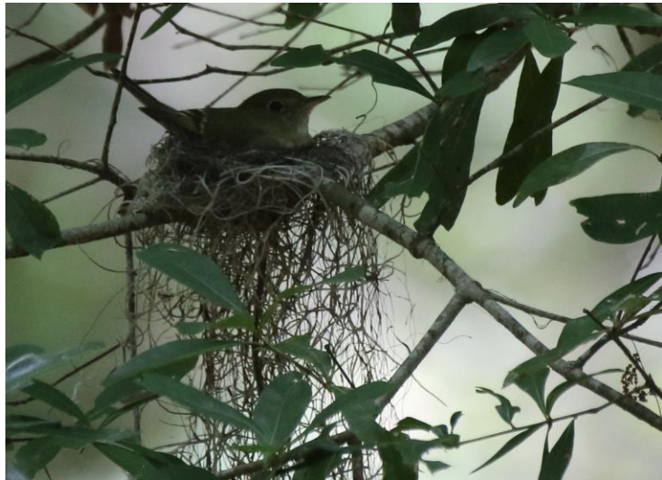
Acadian Flycatcher on nest – Matt Tozar