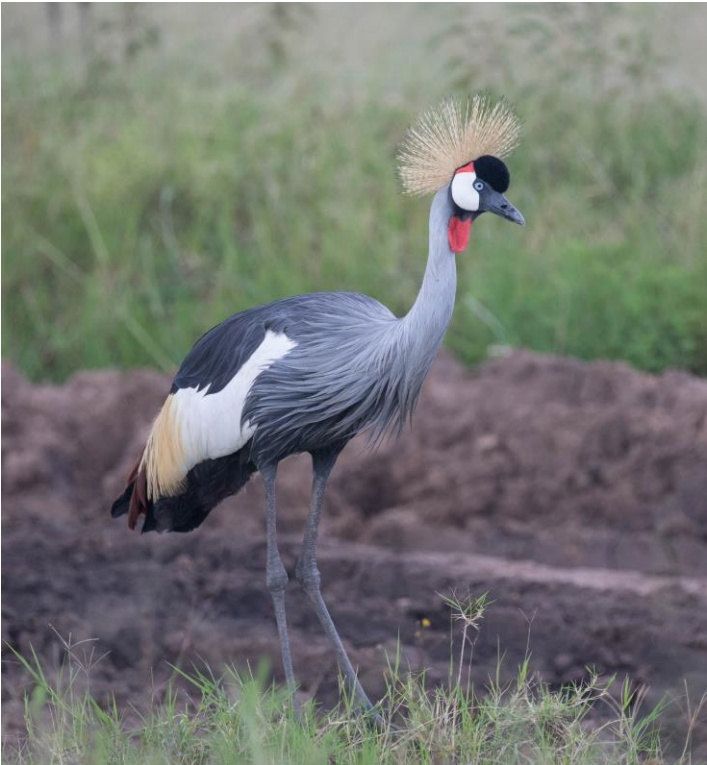
Grey Crowned Crane – Leslie Weichsel