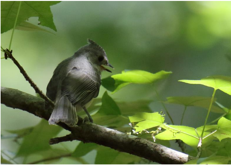
Recently fledged Tufted Titmouse – Matt Tozar