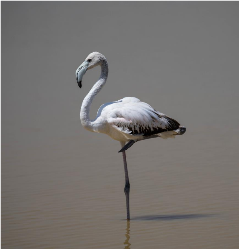
Immature Greater Flamingo – Leslie Weichsel