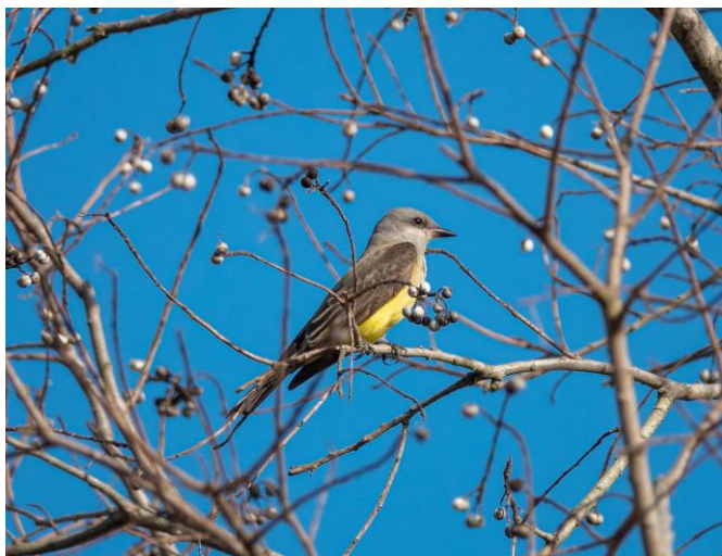
Western Kingbird.